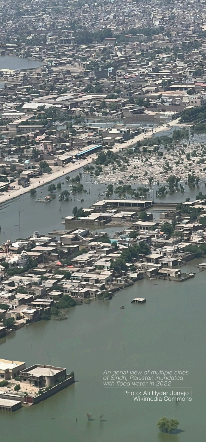
An aerial view of multiple cities of Sindh, Pakistan inundated with flood water in 2022